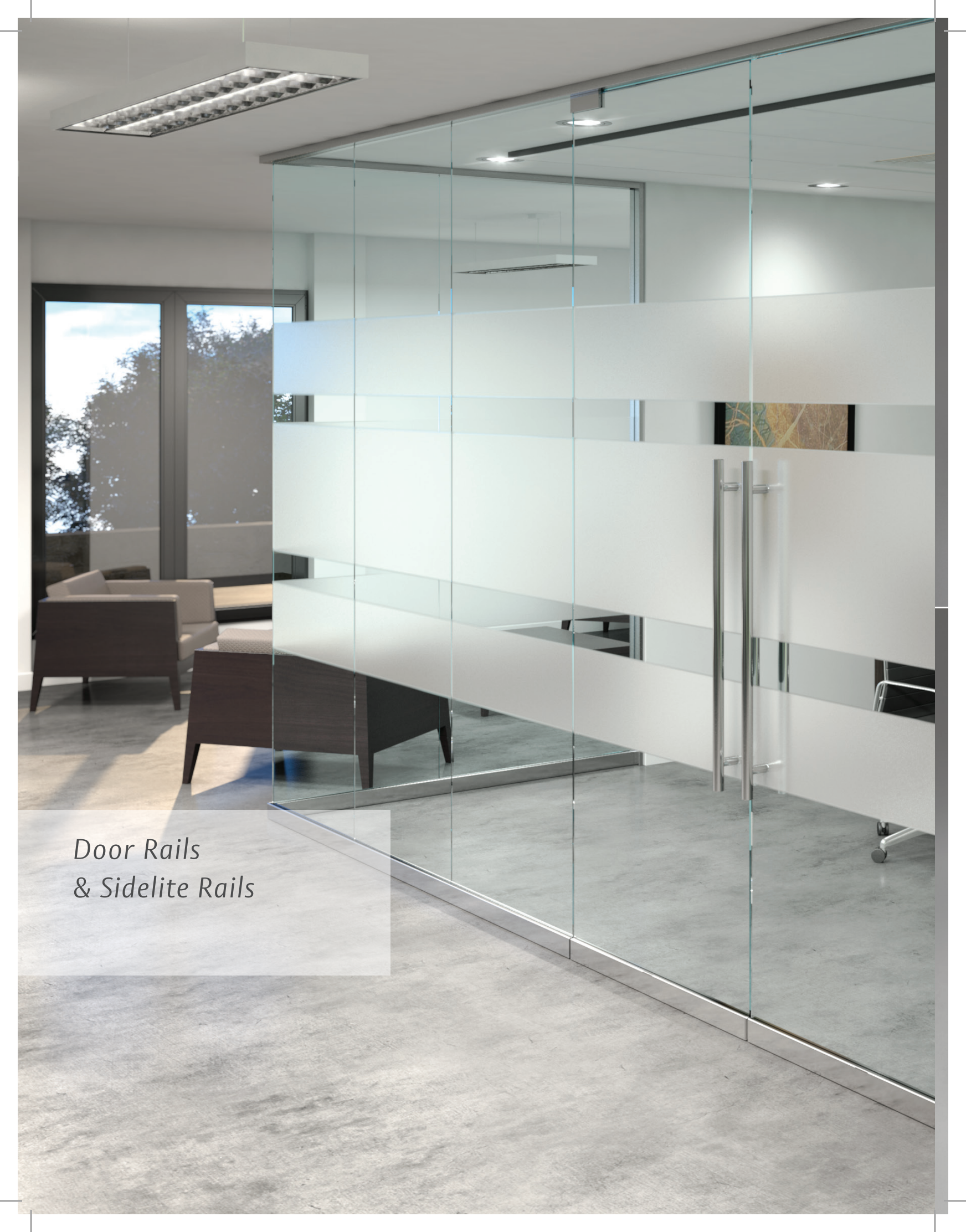
Door Rails & Sidelite Rails